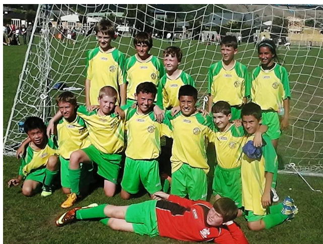
Photo: 12th Grade Team

In 2013 the LHCAFC fielded 25 junior teams and 11 senior teams (9 men's & 2 women's teams). The club had approximately 300 junior players (boys & girls), an 50 First Kicks players (3-6 year olds) and approximately 170 senior players.