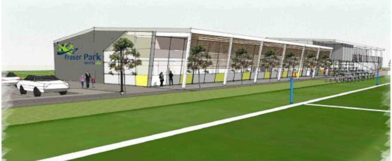
Picture: Fraser Park Sportsville Clubhouse Design Impression