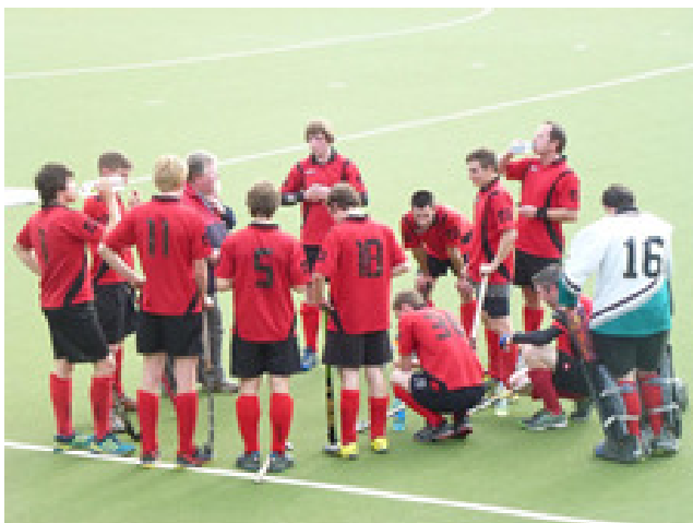
Photo: P2 Men

The R3 mens team, a new addition to the club this year, had a number of players who were giving hockey a go for the first time. The team improved dramatically over the season with many enjoyable encounters. We hope to see players back again next season.