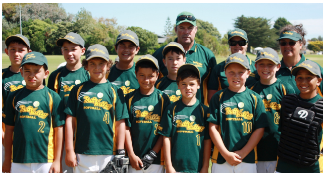
Photo: Hutt Valley U11 Boys Team

Thank you all for helping make Softball in the Hutt Valley a success, while it is clear that we are short of volunteers, the team that are putting in the hours are doing a great job and need a big thank you, as we are all volunteers working to make our game successful for today and the future.